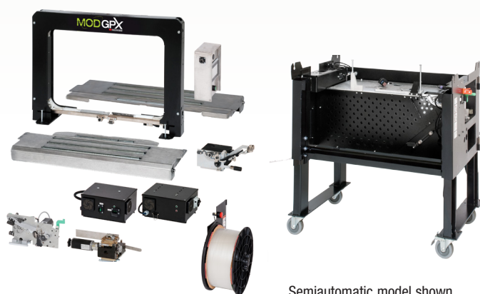
Semiautomatic model shown