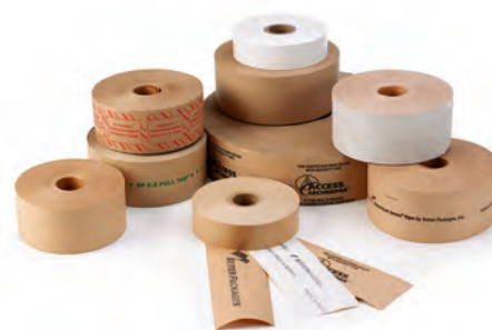
Better Pack Tape™ available in a wide range of SKUs