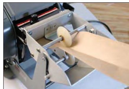
Tape Aerial conveniently holds tape in upright position