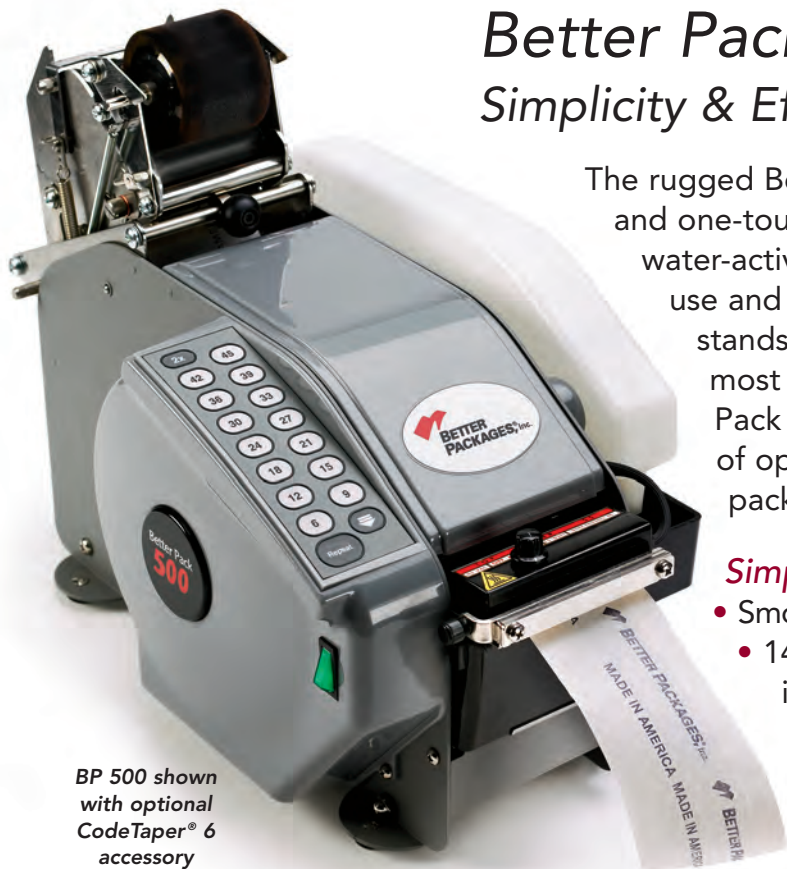
BP 500 shown with optional CodeTaper ® 6 accessory

The rugged Better Pack 500 offers straightforward operation and one-touch dispensing of reinforced and non-reinforced water-activated tape. Engineered for durability, ease of use and safety, this electronic, tabletop workhorse stands up to rough handling and harsh conditions in most work settings. Fast and reliable, the Better Pack 500 will improve the efficiency and speed of operations with medium- to high-volume packaging needs.