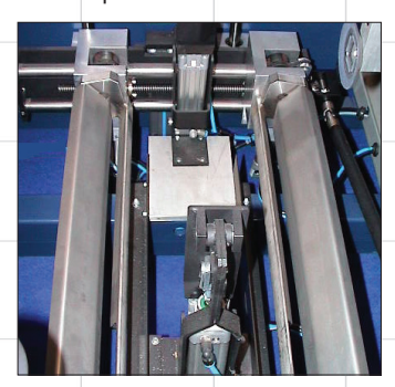
Innovative slotted flap folders fold major flap along their entire length for maximum control

Unique hinged pickup and folding frame reliably opens cases by placing erecting frame suction cups on two panels of blanks