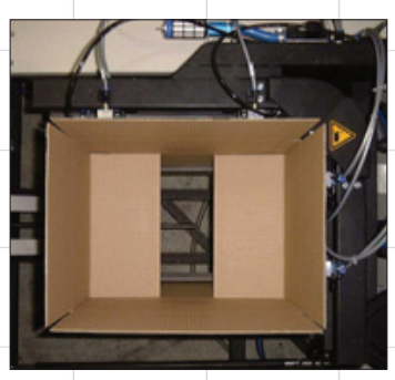
All flaps are folded while case is held square in the erecting frame