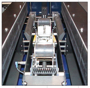
Belt driven exit pulls case over tape head or optional glue station