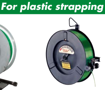
DO-3D Can be suspended from a wall or ceiling.