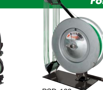
PSD-109 For power equipment. Available in left or right-handed models.