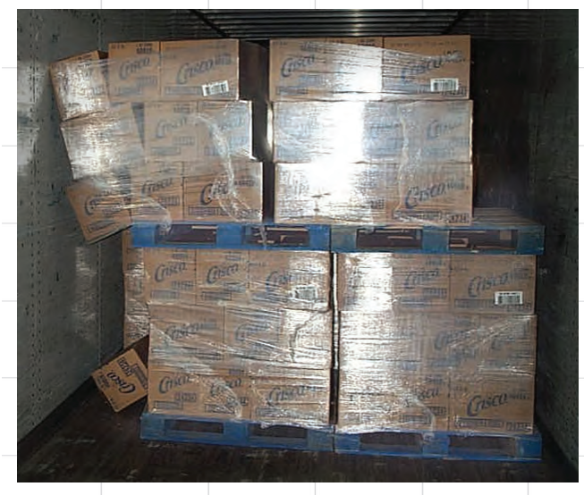
Sudden stops, starts, or vibrations can cause loads to slide off their pallets unless you do something to stop it.