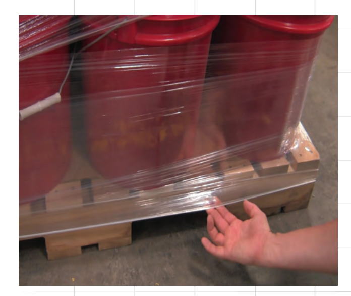
Pallet Grip places the film cable around the shipping pallet and locks the load to it.