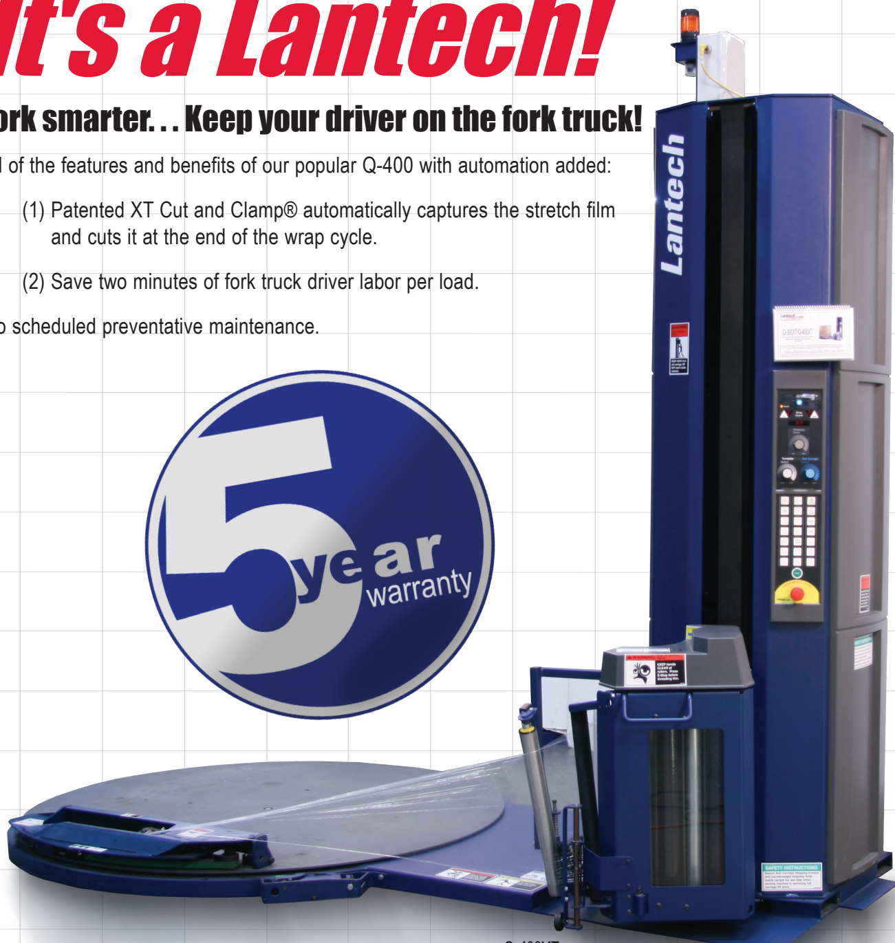
Q-400XT *Shown with Click-n-Go Remote Control option.